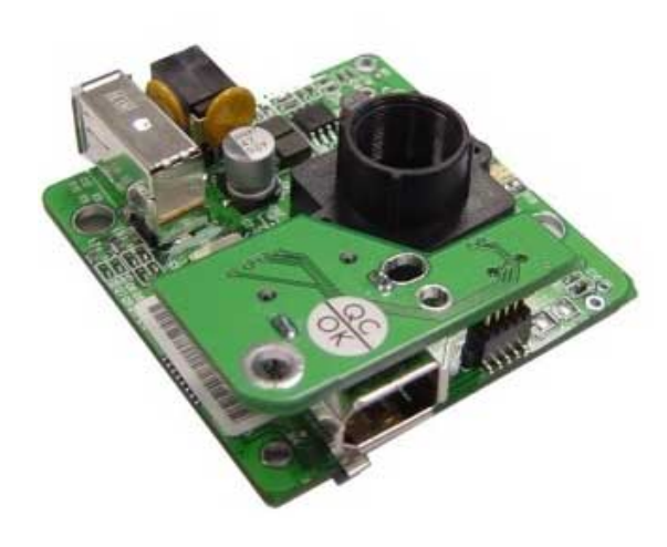
Highest quality with just the board!