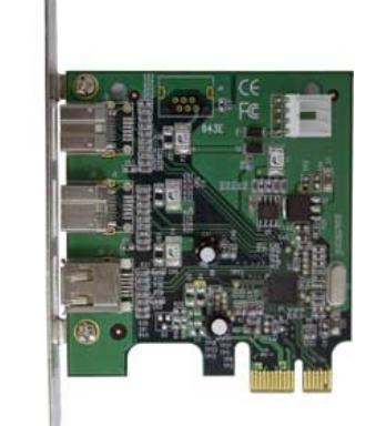
PCI-Express adapter at 800Mbps!