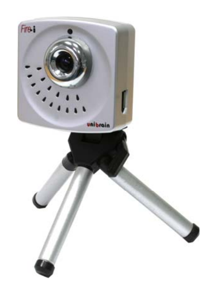
New model! Lightweight housing!