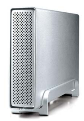
Fastest ever triple connectivity up to 1.5Gbps!

OS* Windows 2000/XP/2003/Vista & Mac OS X 10.2 or later