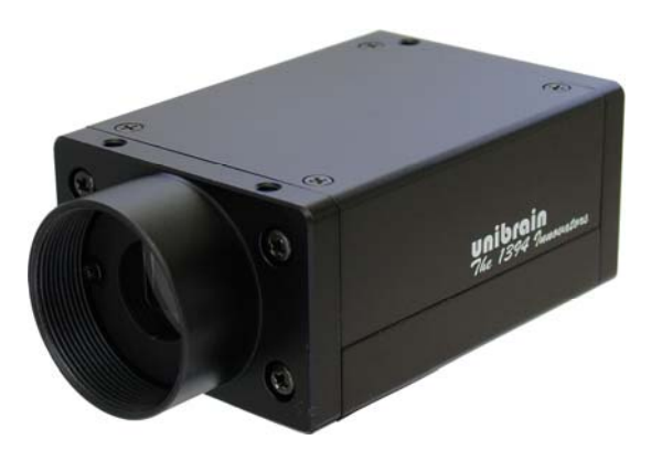
More versatility in space & weight!