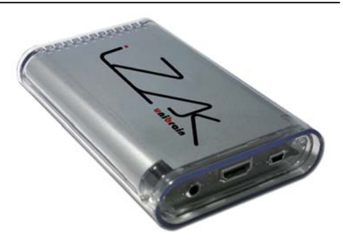
Move your films, music and photos directly to your TV!