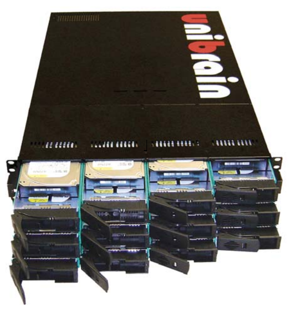
Just Rack 'n' Store!