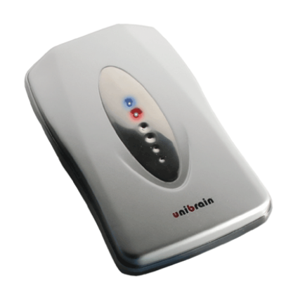
The easy way to move data!

Cache Read Ahead Cache, Write Cache Packaging One 0.5 m (1.5 ft) USB 2.0 cable