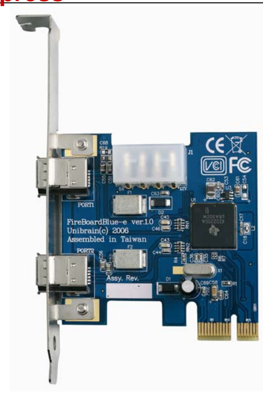
Connection in a snap!