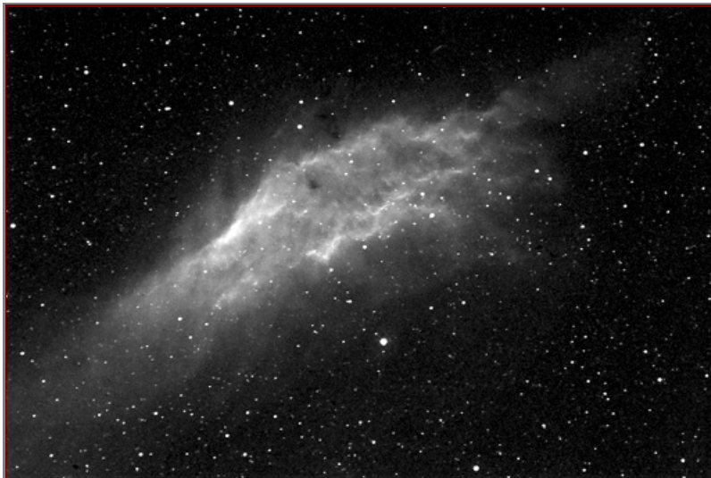
A single 1200 second H-alpha exposure of the California Nebula taken with an ST-7XME camera through a 100 mm F/2.8 camera lens and H-alpha filter under the glare of a nearly full moon.

Except for the increased QE, the CCD specifications remain the same as the ST-7XE. The cosmetic grades also remain the same: The ST-7XME is supplied with a Class 1 CCD as standard. A Class 1 KAF-0402E(ME) CCD has no column or cluster defects.