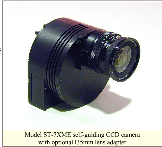
Model ST-7XME self-guiding CCD camera with optional 135mm lens adapter

Of greatest significance is the increased quantum efficiency due to the addition of a microlens array over the pixels and the use of MAR coated cover glass on the KAF-0402ME version. The same kind of improvement has already met with great success in the ST-10XME camera. The peak quantum efficiency for the KAF-0402ME is almost 85%. It is the most sensitive CCD camera in its class. The QE for the blue wavelength of 400 nm is 50% higher than that of the previous KAF-0401E CCD (increased from 30% to 45% absolute QE) and 15% higher in the red spectrum near H-alpha (increased from 72% to nearly 85% absolute peak QE). The resulting high QE from UV to IR makes the ST-7XME perfect for imaging deep space objects such as dim galaxies and emission nebula. By fortunate circumstance, the peak QE occurs very near the H-alpha emission line at 656 nm, making this camera extraordinarily sensitive at this important wavelength. It could be said that this camera was "made for" capturing H-alpha! Previously, this level of QE was achievable only through the process of thinning the wafer and illuminating the image sensor from the backside. However, thinned, back-illuminated CCDs are very expensive. With the KAF-0402ME, similar performance to a back-illuminated CCD is achieved with lower dark current and superior cosmetic specifications in a full frame front illuminated detector.