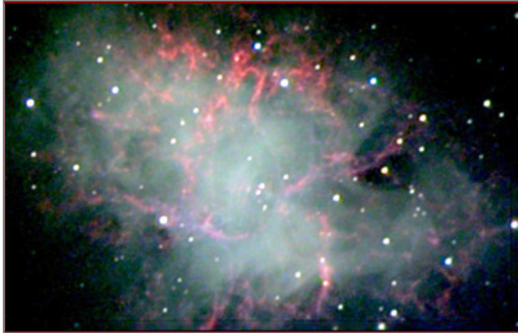
M1. ST-7E LRGB image taken with an AO-7 adaptive optics device through a 16" f/10 telescope. Corrections were made at 4Hz.

catalog and Hubble Guide Star Catalog, plus a non-stellar data base from NCC, IC, PCC (Principle Galaxies Catalog), PK planetary nebulae, WDS (double star catalog), and GCVS (variable star catalog).