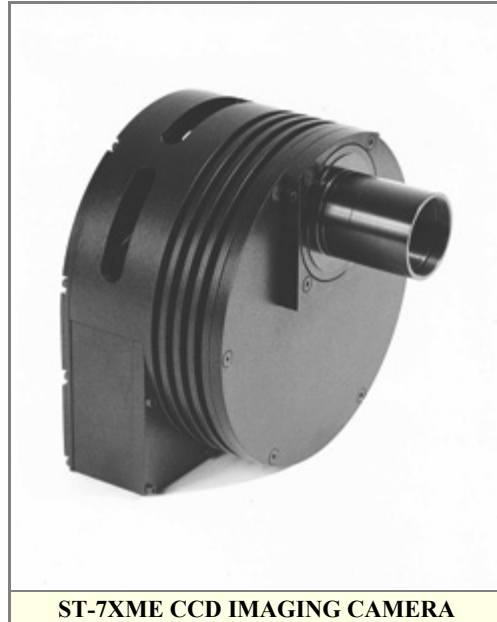
ST-7XME CCD IMAGING CAMERA

The Model ST-7XE/XME is a self-guided imaging camera and contains two CCD detectors; one for guiding and the other for collecting the image. They are mounted in close proximity, both focused at the same plane, allowing the imaging CCD to integrate while the PC uses the guiding CCD to correct the telescope. Using a separate CCD for guiding allows 100% of the primary CCD to be used to collect the image. The telescope correction rate and limiting guide star magnitude can be independently selected. Tests at SBIG indicate that 95% of the time a star bright enough for guiding will be found on the guiding CCD without moving the telescope, using an f/6.3 telescope. Carefully guided exposures up to one hour are possible, enabling a standard Celestron C-8 to capture images showing 19th magnitude stars from typical background observing sites. The imaging camera includes an electro-mechanical shutter, 16 bit analog to digital (A/D) converter, regulated temperature control, and has all of the electronics integrated into the CCD head. Communication to the PC or Mac is through the USB port.