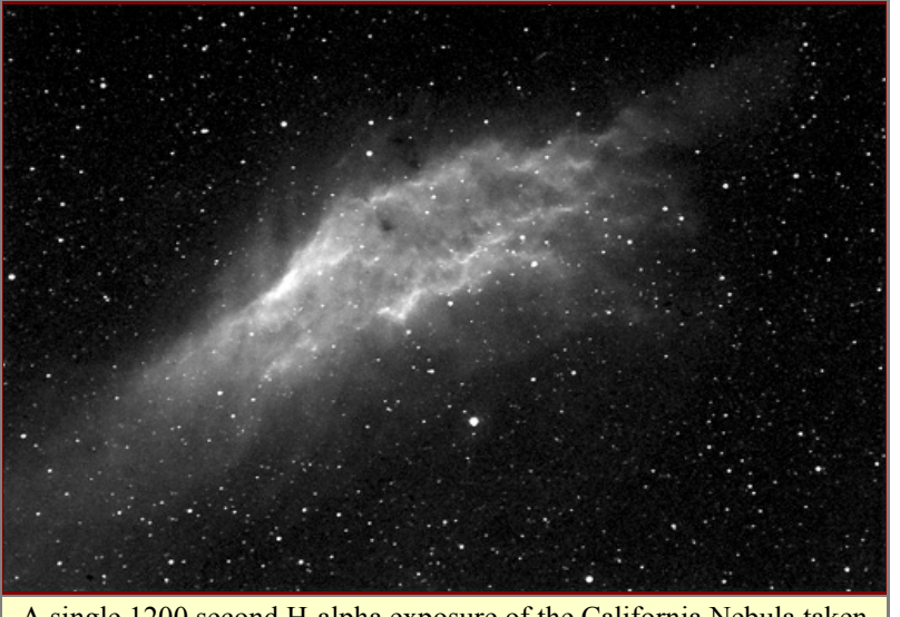
A single 1200 second H-alpha exposure of the California Nebula taken with an ST-7XME camera through a 100 mm F/2.8 camera lens and Halpha filter under the glare of a nearly full moon.

"made for" capturing H-alpha! Previously, this level of QE was achievable only through the process of thinning the wafer and illuminating the image sensor from the backside. However, thinned, backilluminated CCDs are very expensive. With the KAF-0402ME, similar performance to a back-illuminated CCD is achieved with lower dark current and superior cosmetic specifications in a full frame front illuminated detector.