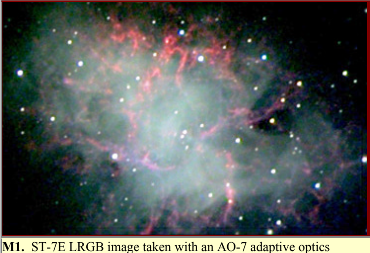
MI. SI-/E LRGB image taken with an AO-/ adaptive optics device through a 16" f/10 telescope. Corrections were made at 4Hz.

catalog and Hubble Guide Star Catalog, plus a non-stellar data base from NCC, IC, PCC (Principle Galaxies Catalog), PK planetary nebulae, WDS (double star catalog), and GCVS (variable star catalog).