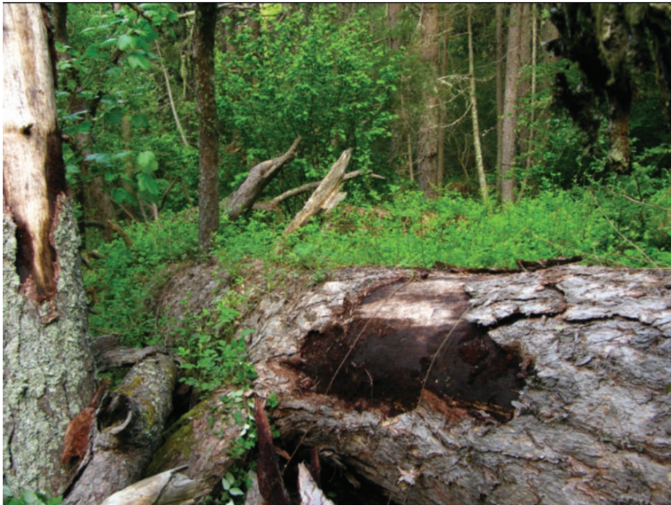
Fig. 1. High diameter logs of the Calabrian pine ( Pinus nigra ) are the most suitable habitat for two species of flat bark beetles ( C. cinnaberinus and C. haematodes ), where they find suitable prey (Sila National Park, Calabria, Italy).

rearing based on a previous study (Bonacci et al. 2018). A total of 120 larvae and a total of 48 emerged adults ( C. cinnaberinus = 24 and C. haematodes = 24) were used for experiments on dietary preferences. Finally, all adults and larvae were released back in the sampled sites in the Sila National Park.