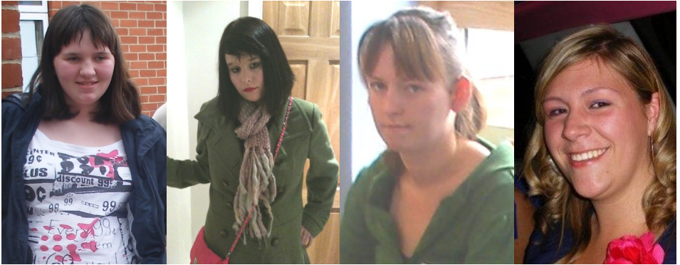
Growing up: 15 years (left); 17 years (centre left); 18 years (centre right and right)