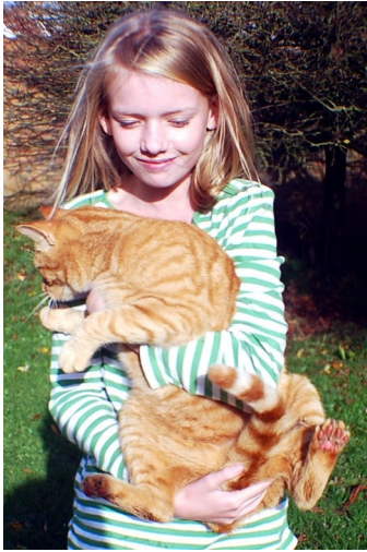
Loving and kind