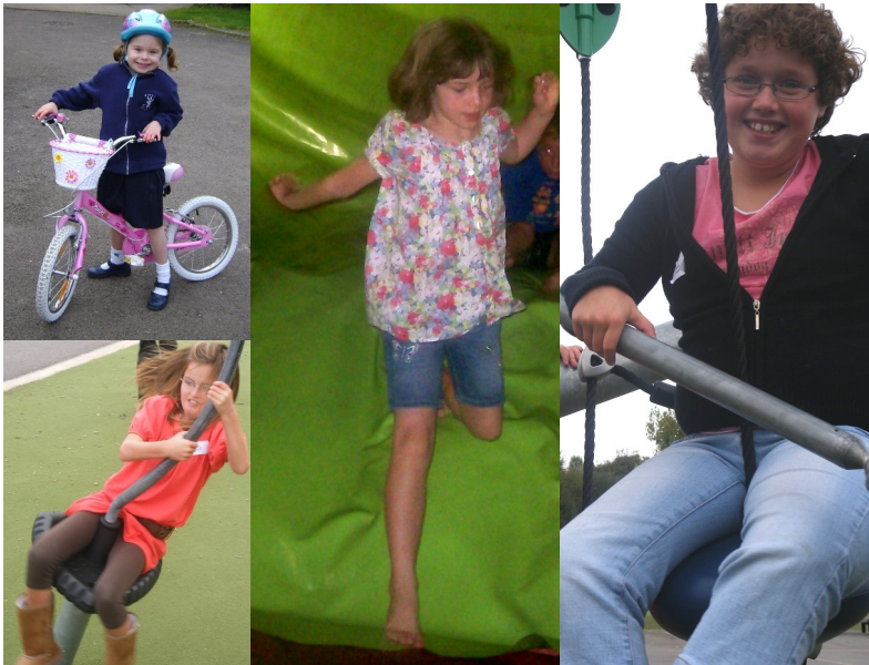
Girls on the move

Underlying the slight delay are motor coordination problems in many (Otter 2009) and continuation of low muscle tone and bendy joints in some (Triple X syndrome group 2006; Tartaglia 2010). Among 24 children aged 0-5, a quarter of the girls had low muscle tone, affecting different parts of the body. Of four children with unusually bendy joints and low muscle tone, three were late walkers, taking their first steps after 18 months. Among a group of 25 girls aged 6-10, ten had hypotonia (low muscle tone), again affecting different parts of the body. In the 11-16 age group, 3/17 girls had slack abdominal muscles, giving them a protruding stomach (Triple X syndrome group 2006). Other studies have shown that as a group, girls are more easily tired (Otter 2009).