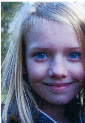
Twelve years old

Almost 70 per cent of girls with 47,XXX do fine at mainstream school, although most have some 1:1 teaching, usually for reading, although they may also need extra help in other subjects such as maths. The need for support may be obvious in the early years and it seems that if proper support is provided in the early years, educational levels are maintained during adolescence (Otter 2009; Triple X syndrome group 2006).