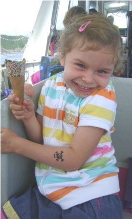
Five years old

Around half of girls show a delay in both understanding and speech and three-quarters of school-age girls have some difficulty with language. Studies suggest that 40-90 per cent of girls benefit from speech therapy. The best age to start speech therapy isn't certain, but some say the earlier the better as early intervention can do no harm and may do some good (Linden 2002; Triple X syndrome group 2006; Otter 2009; Tartaglia 2010).