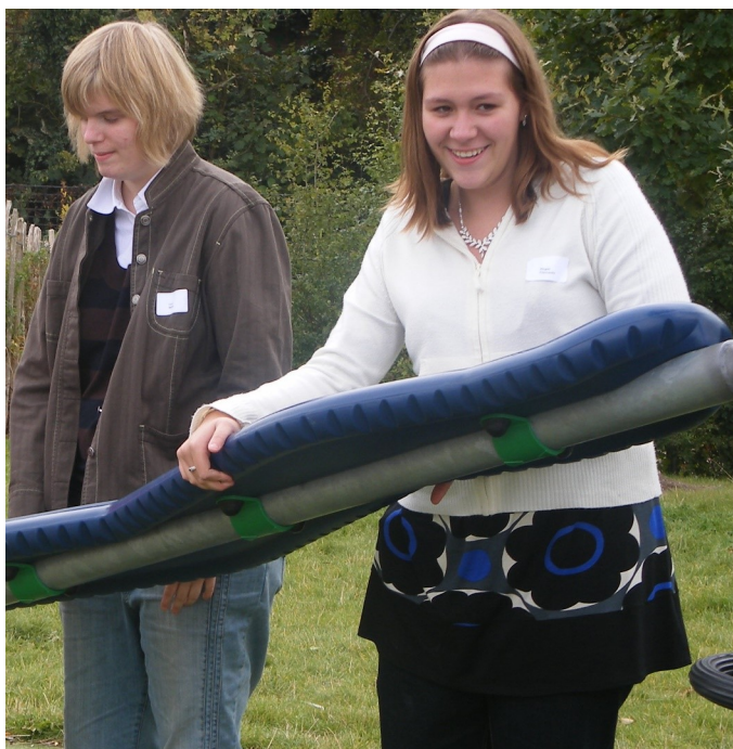
Sixteen years old

Many girls with triple X syndrome take longer than average to be potty trained. They achieve this on average around 36 months (range 12 months to 10 years) with the great majority clean and dry by four years. Night-time dryness emerges typically in the fourth year, on average by 44 months, but the range is broad, from 18 months to over six years (Triple X syndrome group 2006).