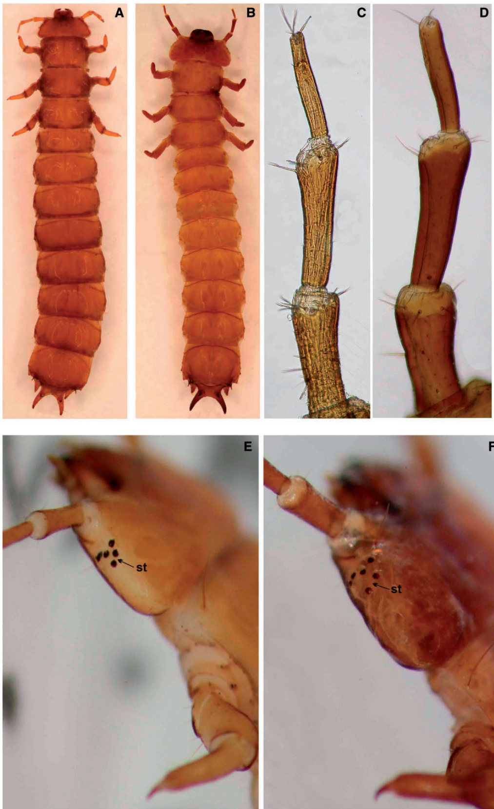
Fig. 1. Larva of C. cinnaberinus . (A) Habitus (dorsal view). (C) Antenna. (E) Head with stemmata (lateral view). Larva of C. haematodes . (B) Habitus (dorsal view). (D) Antenna. (F) Head with stemmata (lateral view). st stemmata.